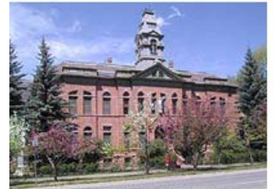
PITKIN COUNTY COURTHOUSE